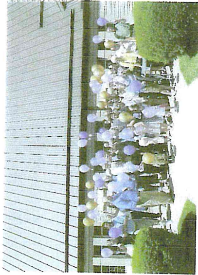
150 th Celebration

St. John's Lutheran Church is committed to mission work and community service that is both local and global.