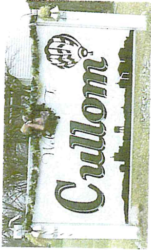
Welcome to Cullom

The church has a strong foundation with the desire to grow. We are praying every day to find that person. It could be you. This is the call you have been waiting for.